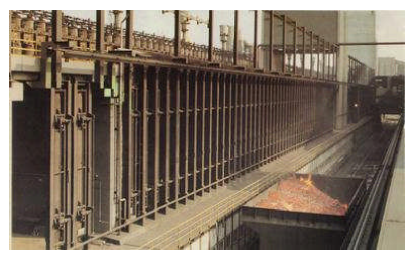
Figure 1: "Coke Side" of a By-Product Coke Oven Battery. The oven has just been "pushed" and railroad car is full of incandescent coke that will now be taken to the "quench station".

The majority of coke produced in the United States comes from wet-charge, by-product coke oven batteries (Figure 1). The entire cokemaking operation is comprised of the following steps: Before carbonization, the selected coals from specific mines are blended, pulverized, and oiled for proper bulk density control. The blended coal is charged into a number of slot type ovens wherein each oven shares a common heating flue with the adjacent oven. Coal is carbonized in a reducing atmosphere and the off-gas is collected and sent to the by-product plant where various by-products are recovered. Hence, this process is called by-product cokemaking.